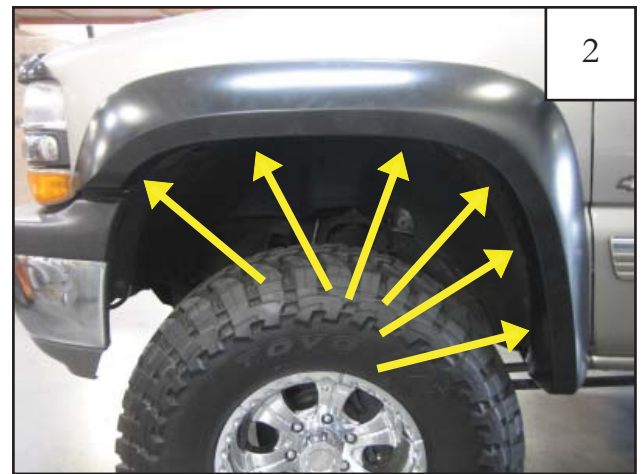
Install six tuflocks using a #2 stubby screwdriver.