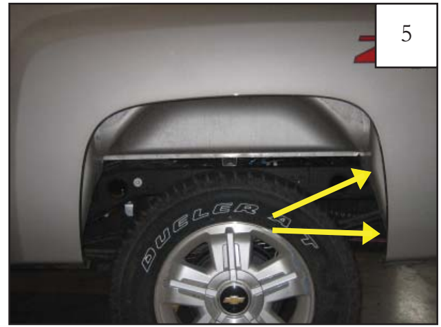
Remove two factory screws with a #2 stubby screwdriver.