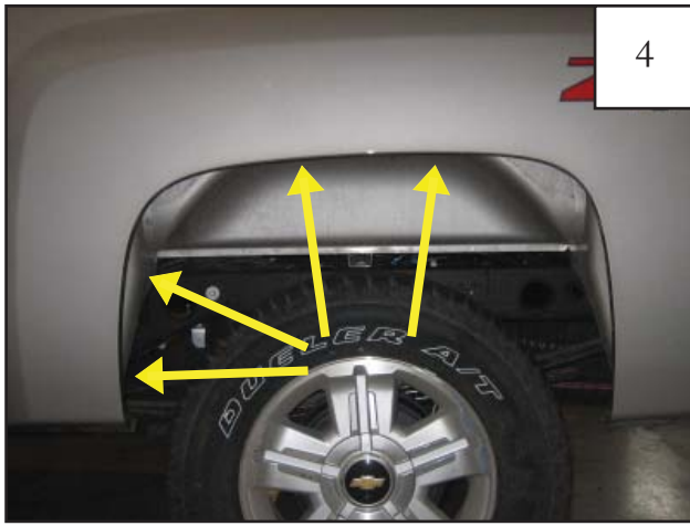
Remove four factory fasteners with a pry tool.