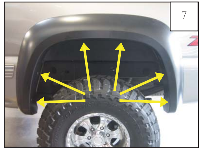
Install six tuflocks using a #2 stubby screwdriver.