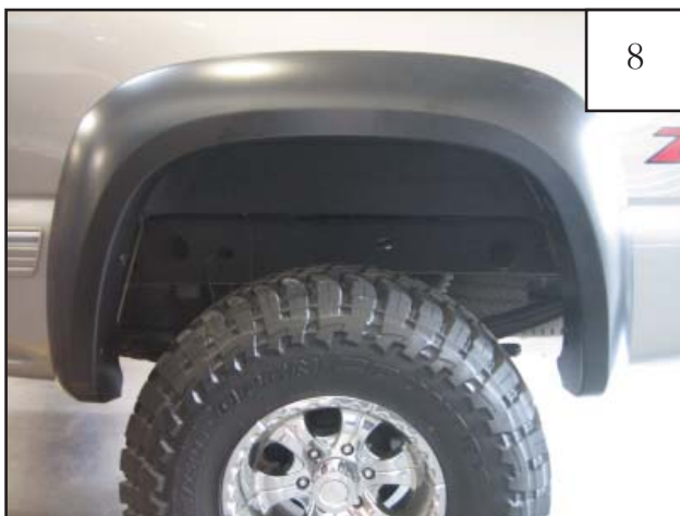
Completed rear flare installation.