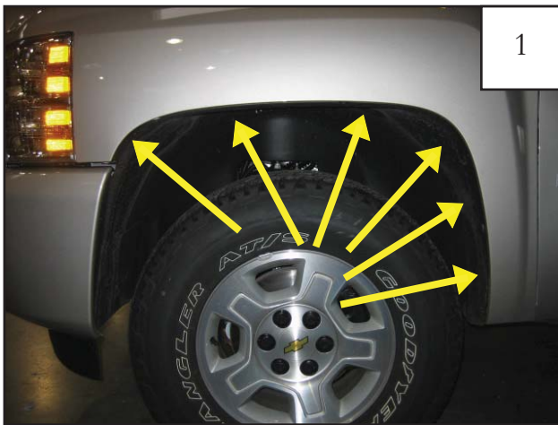
Remove six factory fasteners with a pry tool.