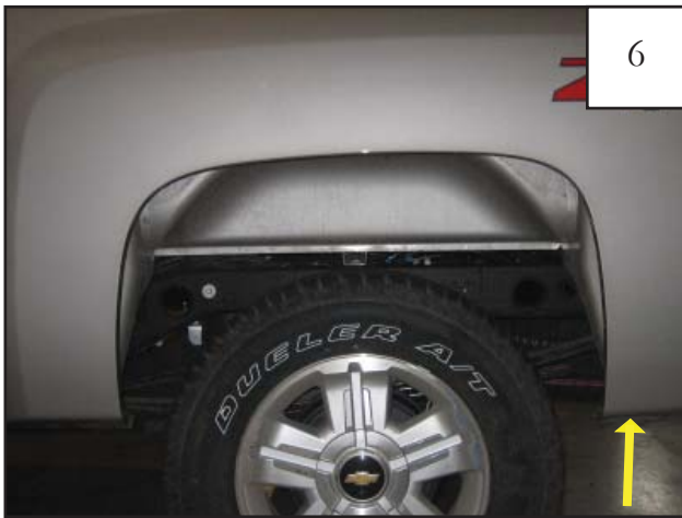
Remove one factory bolt with a 1/2" wrench.