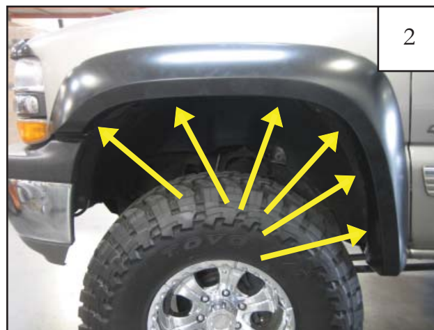
Install six tuflocks using a #2 stubby screwdriver.